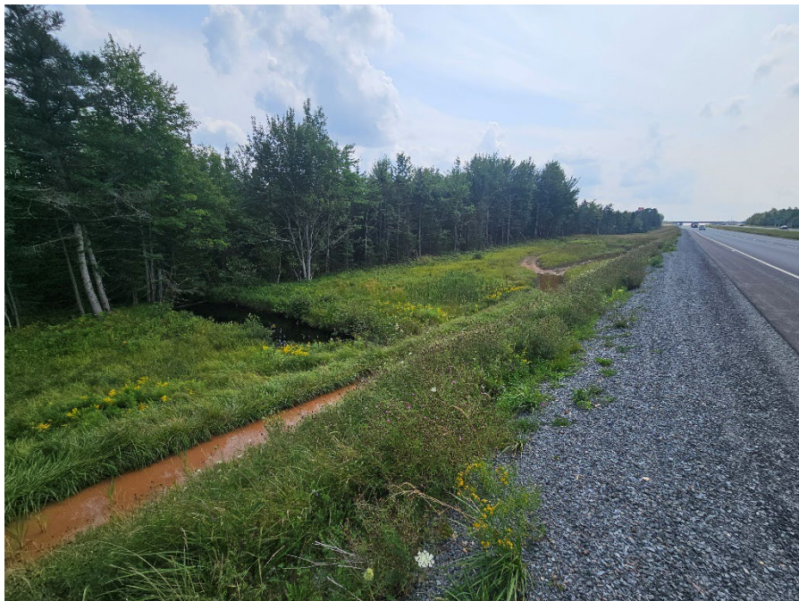
Ph 2 - Upper Extents of Study (Hwy 102 Intercept)