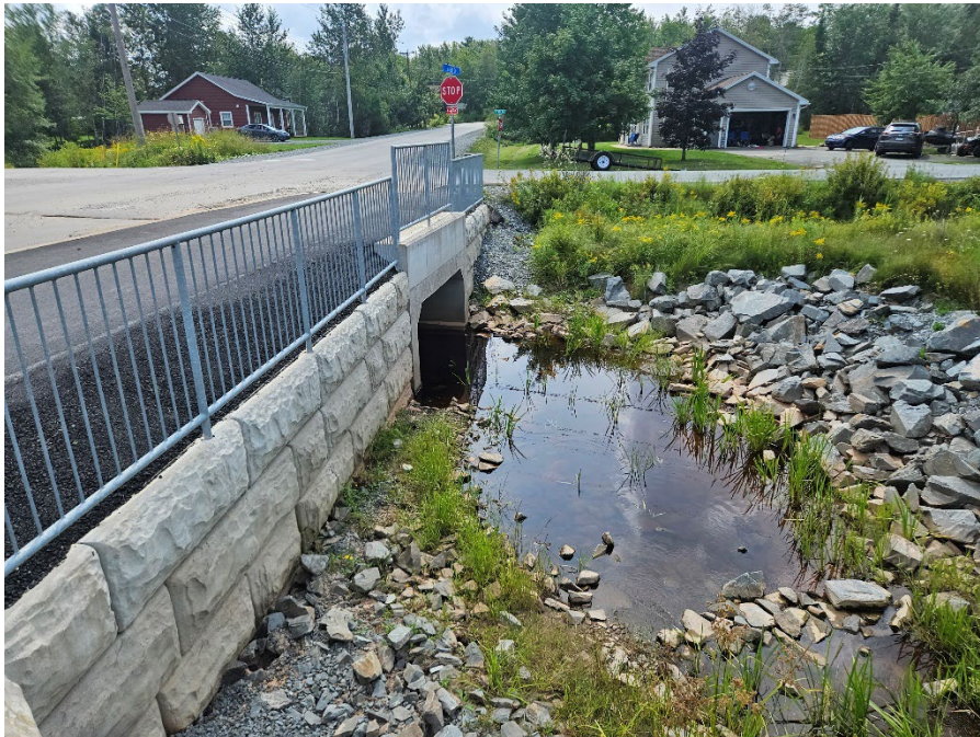
Ph 8 - Culvert at Mariah Drive and Turner James Ave