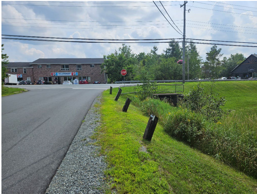
Ph 4 - Lower Extents of Study (Hwy 2 Intercept)