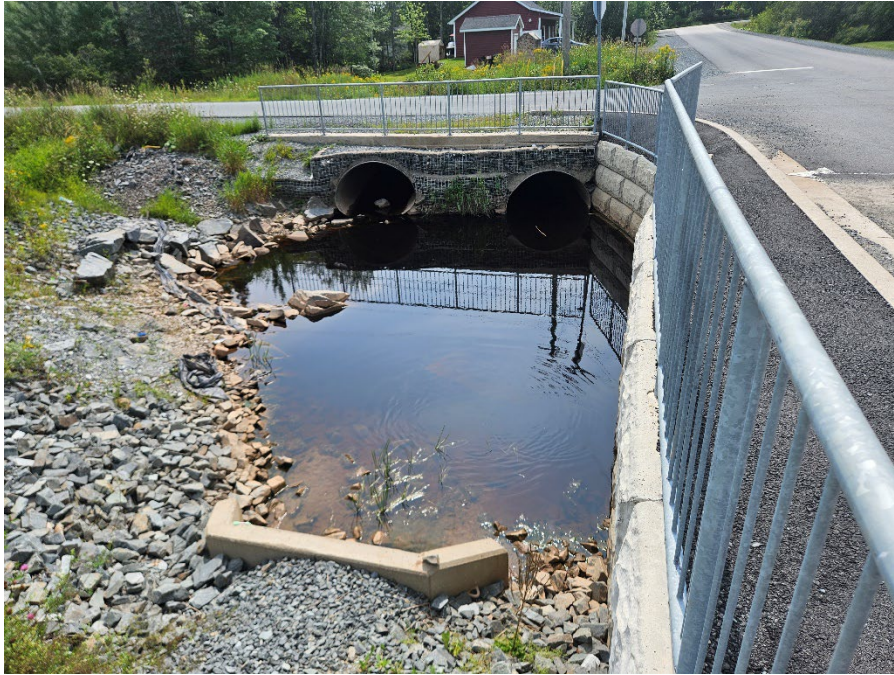
Ph 7 - Culvert at Mariah Drive and Turner James Ave