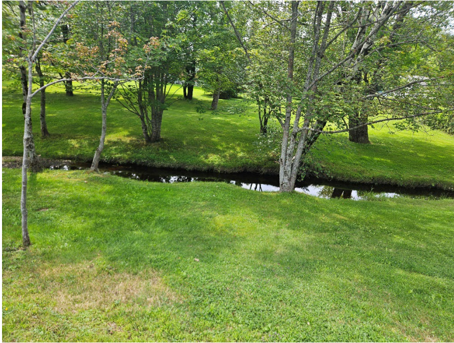
Ph 5 - Paley Brook, along Logan Drive