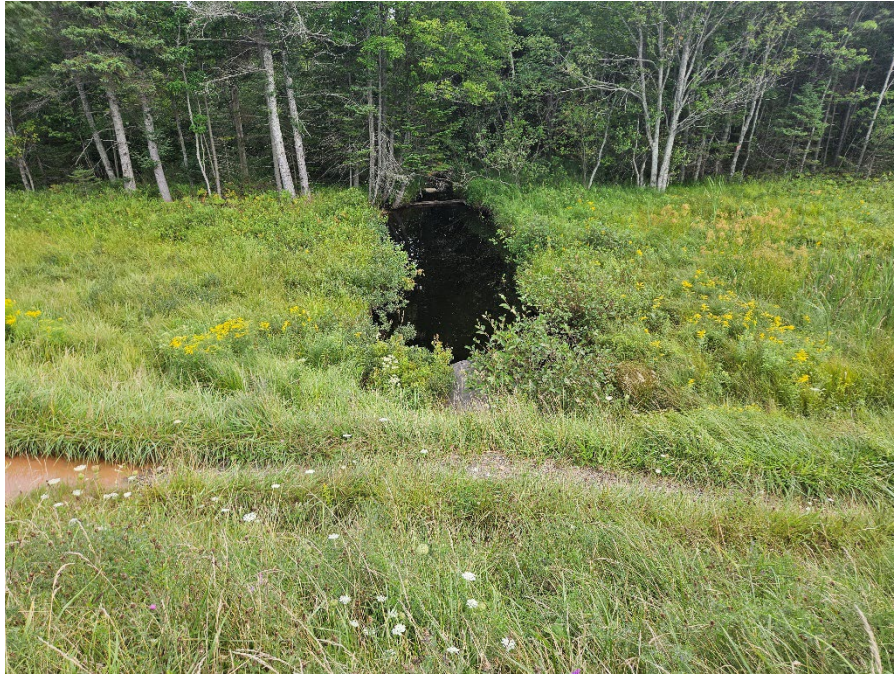
Ph 1 - Upper Extents of Study (Hwy 102 Intercept)