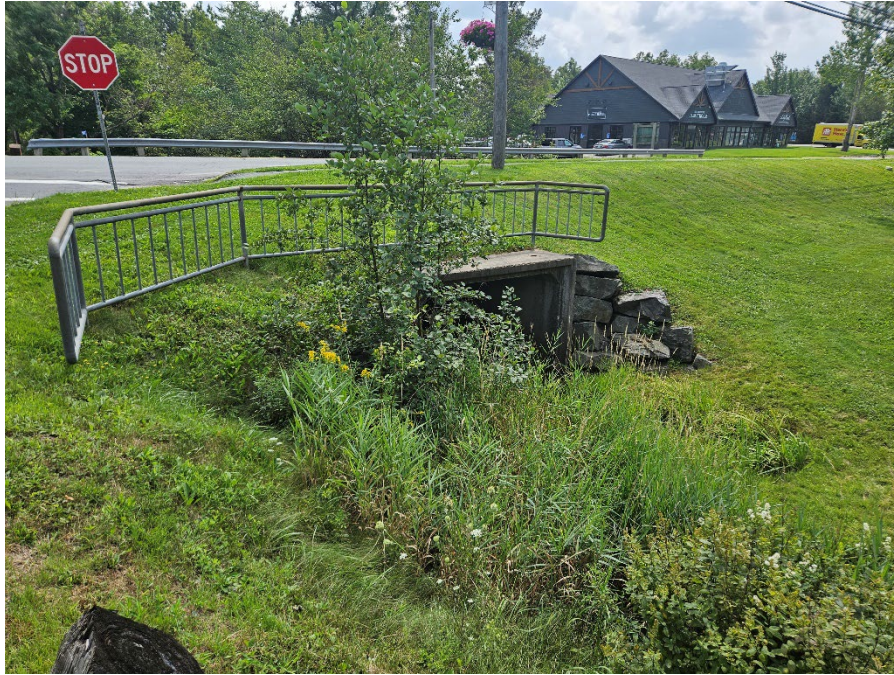
Ph 3 - Lower Extents of Study (Hwy 2 Intercept)