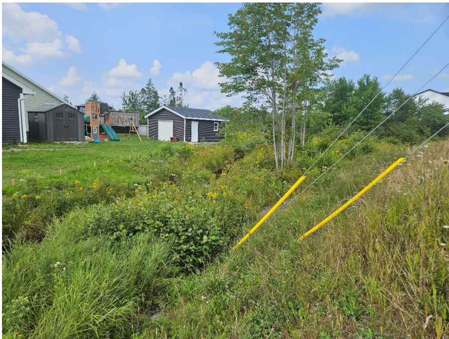
Ph 6 - PID 45374113